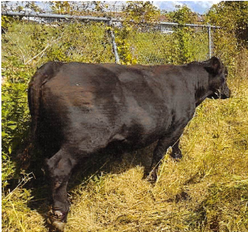
Madison County Sheriff's Office Case #24-01566